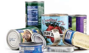
Food & Beverage Cans