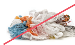
NO Plastic Bags & Film (Find a recycling site at plasticfilmrecycling.org )