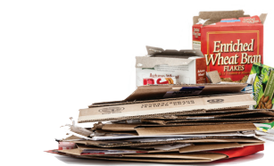
Flattened Cardboard & Paperboard