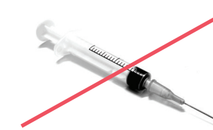
NO Needles (Keep medical waste out of recycling. Place in safe disposal containers like Waste Management's MedWaste Tracker® box.)