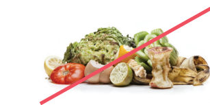
NO Food Waste (Compost instead!)