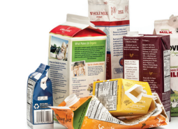
Food & Beverage Cartons