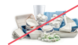
NO Foam Cups & Containers (Check Earth911.org for options.)