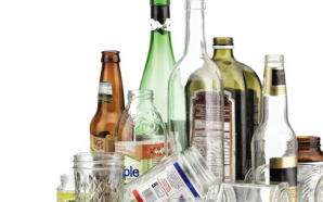
Glass Bottles & Containers